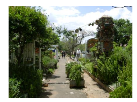
From the picture archive Steam trip to Cullinan November 2009