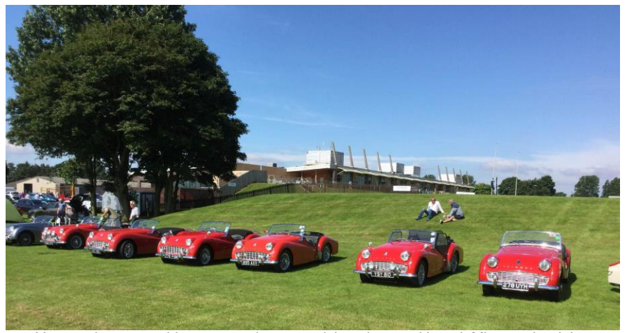
You can have any side screen colour you wish as long as it's red. Mine on the right

It is quite mind blowing seeing the number of cars at the IWE. I do not know what the official figure is, but the various guestimates suggest between 500 and 700 Triumphs that were present.