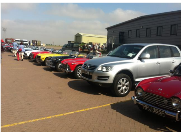
Notice my TR 14 "plastic" amongst the Triumphs!