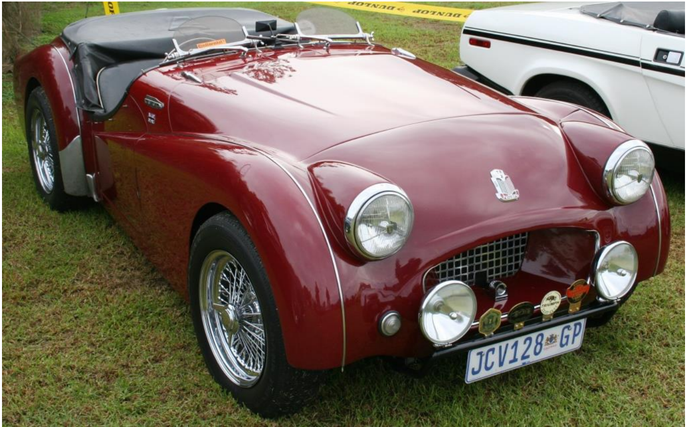
Harry Fairley's TR2 (Jhb Club)

In 1953 Triumph released the TR2 using a tuned version of the 1991cc Standard Vanguard engine producing 90 HP.