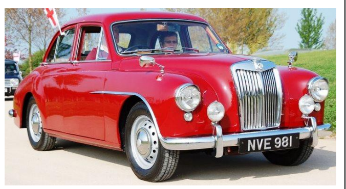
Beginning of a new series of cars

Aston Martin DB2/4 is a grand tourer sold from 1953 through 1957. The Lagonda dual overhead cam straight-6 engine, designed by W. O. Bentley was used. In September 1953 a 2,6 L 125 HP motor (later upgraded to a 2,9L 140 bhp) was fitted to the car. Top speed with the 2,9L engine was 120 mph (193 km/h) was achievable with acceleration of 0-60 mph (97 km/h) in 10.5 seconds. Fuel consumption of 23.0 miles per imperial gallon (12.3 L/100 km). Three works cars were prepared for the 1955 Monte Carlo Rally and two for the Mille Miglia. The test cars cost £2621. A total of 764 DB2/4s were produced. A drop head coupé (DHC) appeared in the Alfred Hitchcock film " The Birds ".