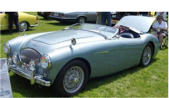
Beginning of a new series of cars

Aston Martin DB2/4 is a grand tourer sold from 1953 through 1957. The Lagonda dual overhead cam straight-6 engine, designed by W. O. Bentley was used. In September 1953 a 2,6 L 125 HP motor (later upgraded to a 2,9L 140 bhp) was fitted to the car. Top speed with the 2,9L engine was 120 mph (193 km/h) was achievable with acceleration of 0-60 mph (97 km/h) in 10.5 seconds. Fuel consumption of 23.0 miles per imperial gallon (12.3 L/100 km). Three works cars were prepared for the 1955 Monte Carlo Rally and two for the Mille Miglia. The test cars cost £2621. A total of 764 DB2/4s were produced. A drop head coupé (DHC) appeared in the Alfred Hitchcock film " The Birds ".