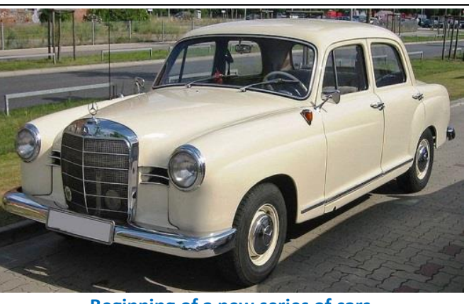
Beginning of a new series of cars

The Mercedes-Benz 180 (W120 and W121) "Ponton" cars were produced from 1953 through 1962. The four-cylinder 180 and 190 were the mainstay of Mercedes' line-up during this period. Together with the more luxurious and somewhat larger 220 they constituted 80% of Mercedes-Benz' production between 1953 and 1961. The form and body of the car changed little during its production run. A roadster variant, the R121, better known as the 190SL, was produced from 1955 to 1963. The first 4 cylinder engine for the 180 was an 1800cc petrol delivering 51HP (38kW).